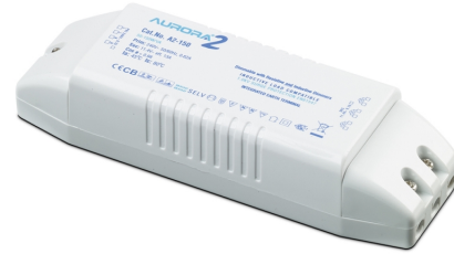
35-105W/VA Electronic Transformer